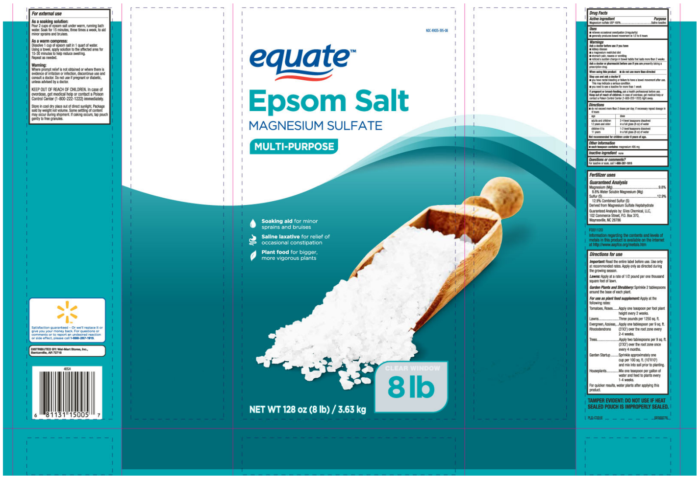
Equate Epsom Salt 8 LB