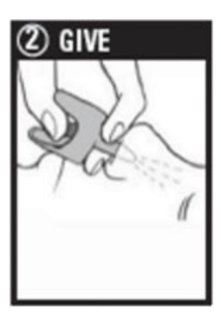
Step 2: GIVE 1st dose in the nose