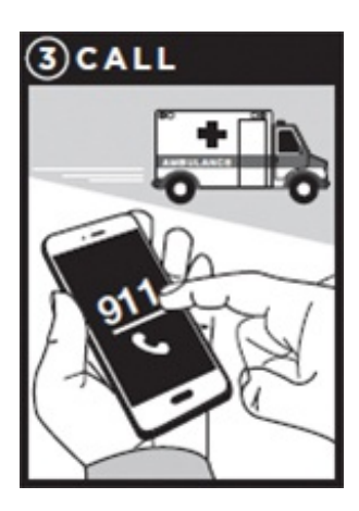
Step 3: CALL 911

• CALL 911 immediately after giving the 1st dose