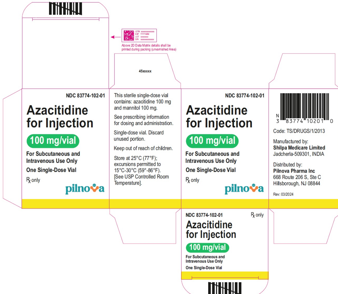
Azacitidine for injection 100mg/vial, carton label