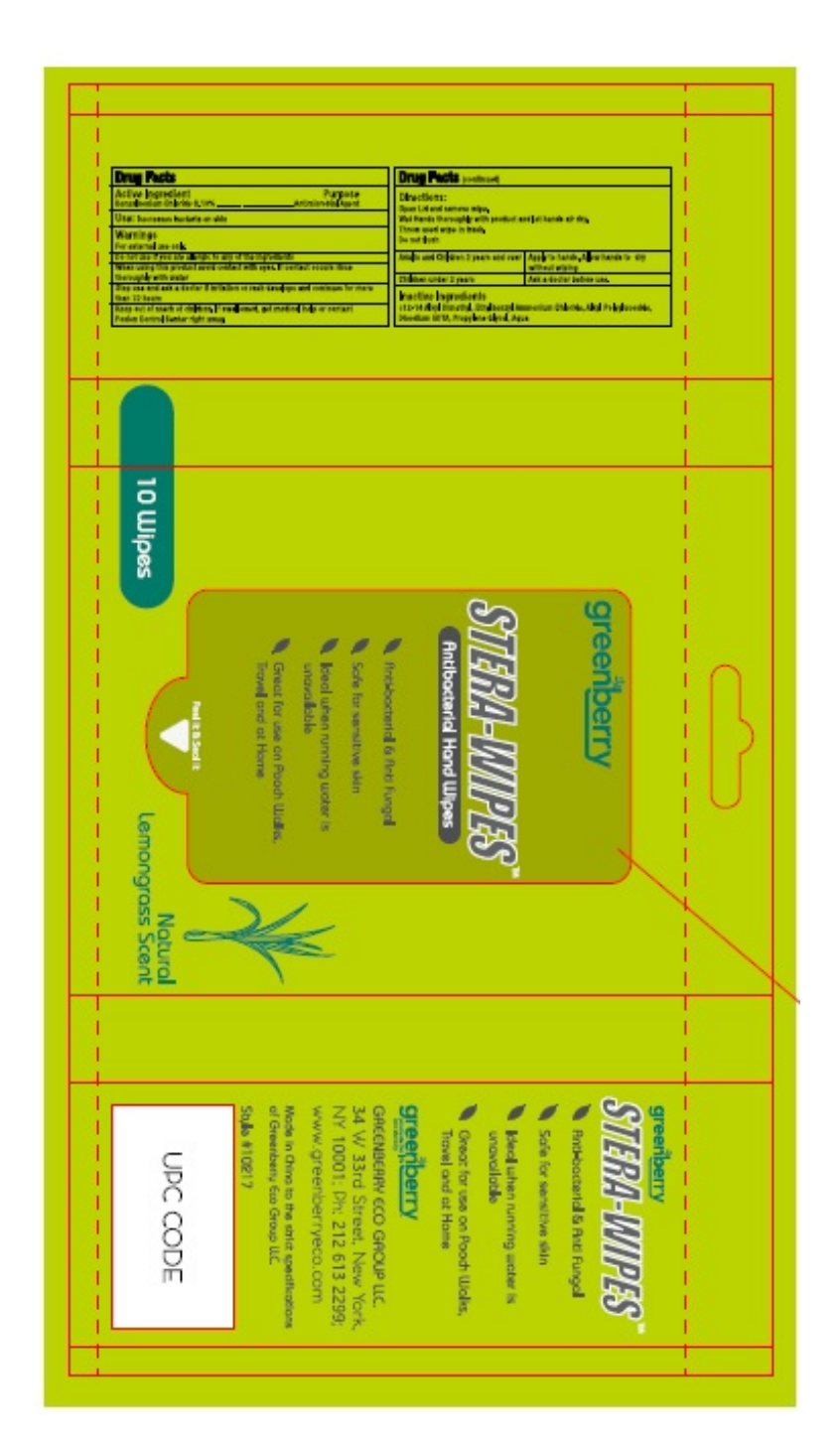
Label 110 Wipes