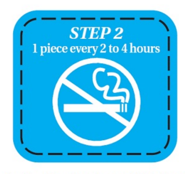
At the Beginning of Week #7