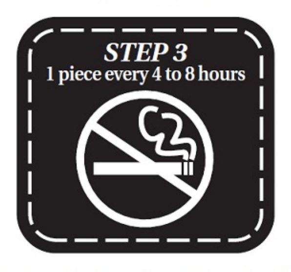
At the Beginning of Week #10