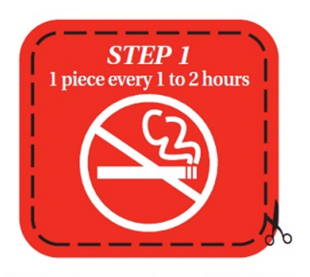
At the Beginning of Week #1 (Quit Date)