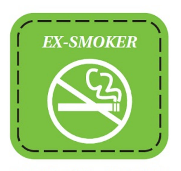
12 Weeks After Quit Date