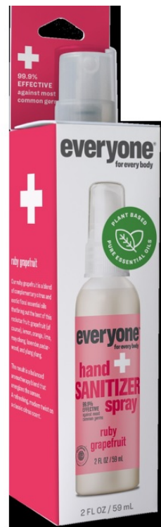
BOTTLE - 54748-304-05