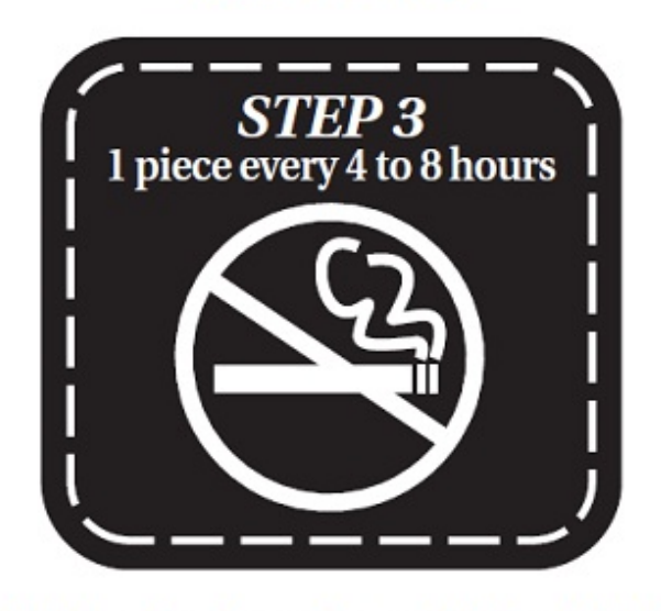
At the Beginning of Week #10