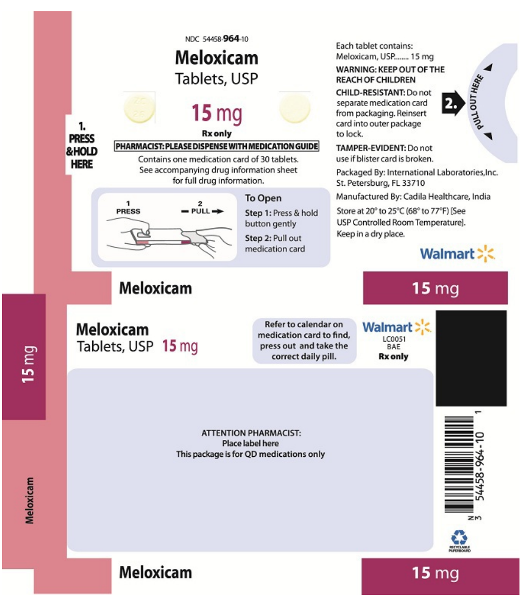
Meloxicam 15mg Adherence Package