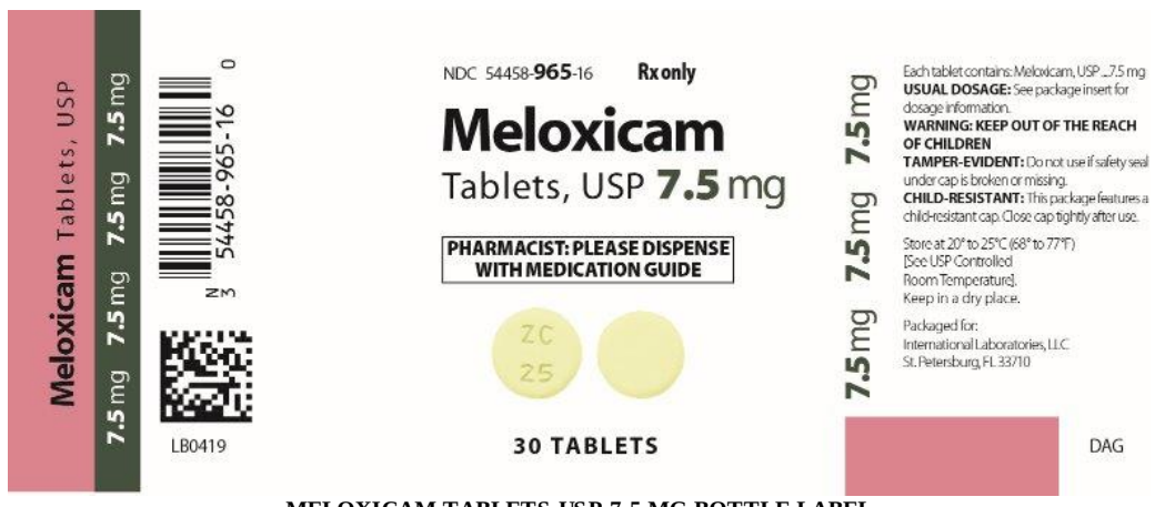
MELOXICAM TABLETS USP 7.5 MG BOTTLE LABEL