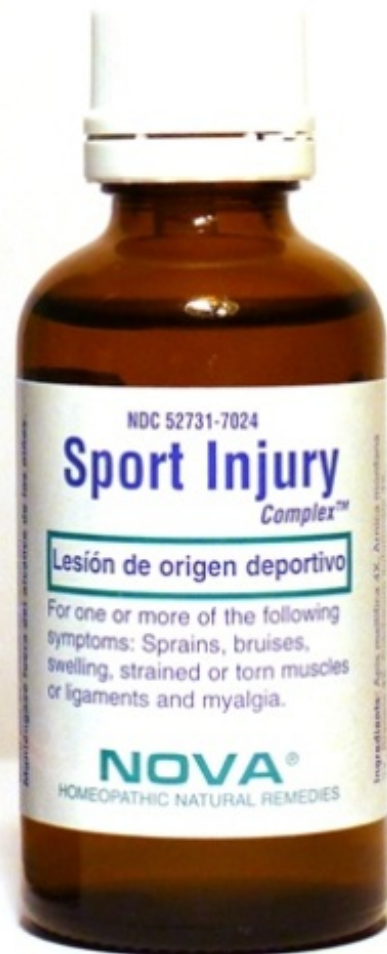
Sport Injury Complex Bottle Label