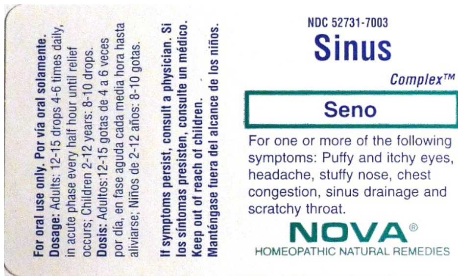
Sinus Complex Box

Ingredients: Antimonium tartaricum 6X, Echinacea angustifolia 4X, Euphorbium officinarum 6X, Herpar sulphuris calcareum 8X, Hepatica tribola 4X, Hydrastis canadensis 4X, Mercurius sulfuratus ruber 10X, Natrum muriaticum 12X, Phosphorus 12X, 20% USP Alcohol, a.a.