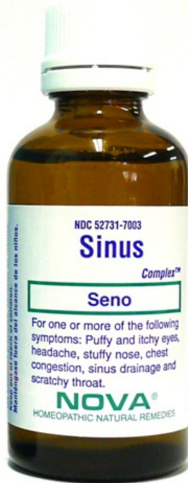
Sinus Complex Bottle Label