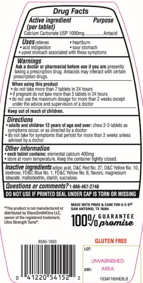
Package Label 72 Chewable Tablets