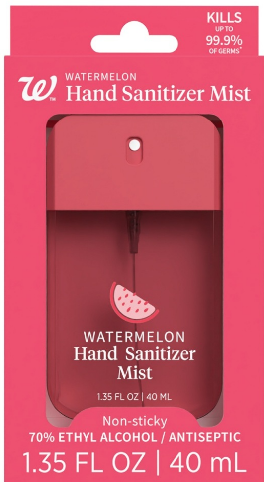
Inner Package Label