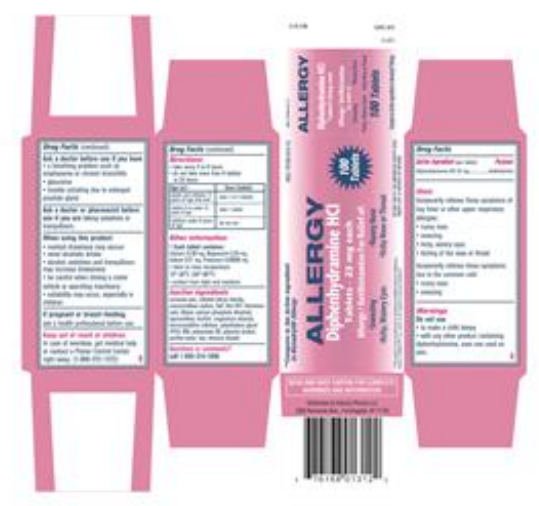
VP CT 077 DG Allergy 100CT Carton