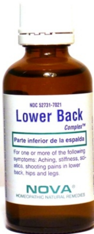
Lower Back Complex Bottle Label