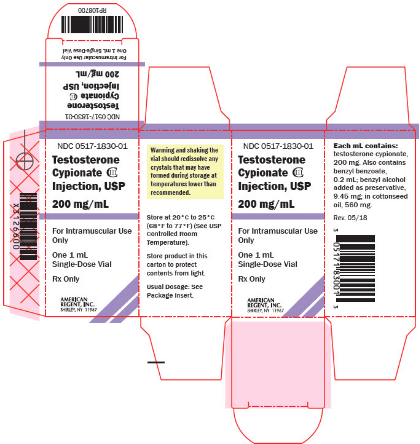
Serialization Label (1 mL)