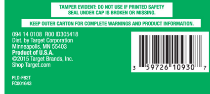
Target mucus relief DM