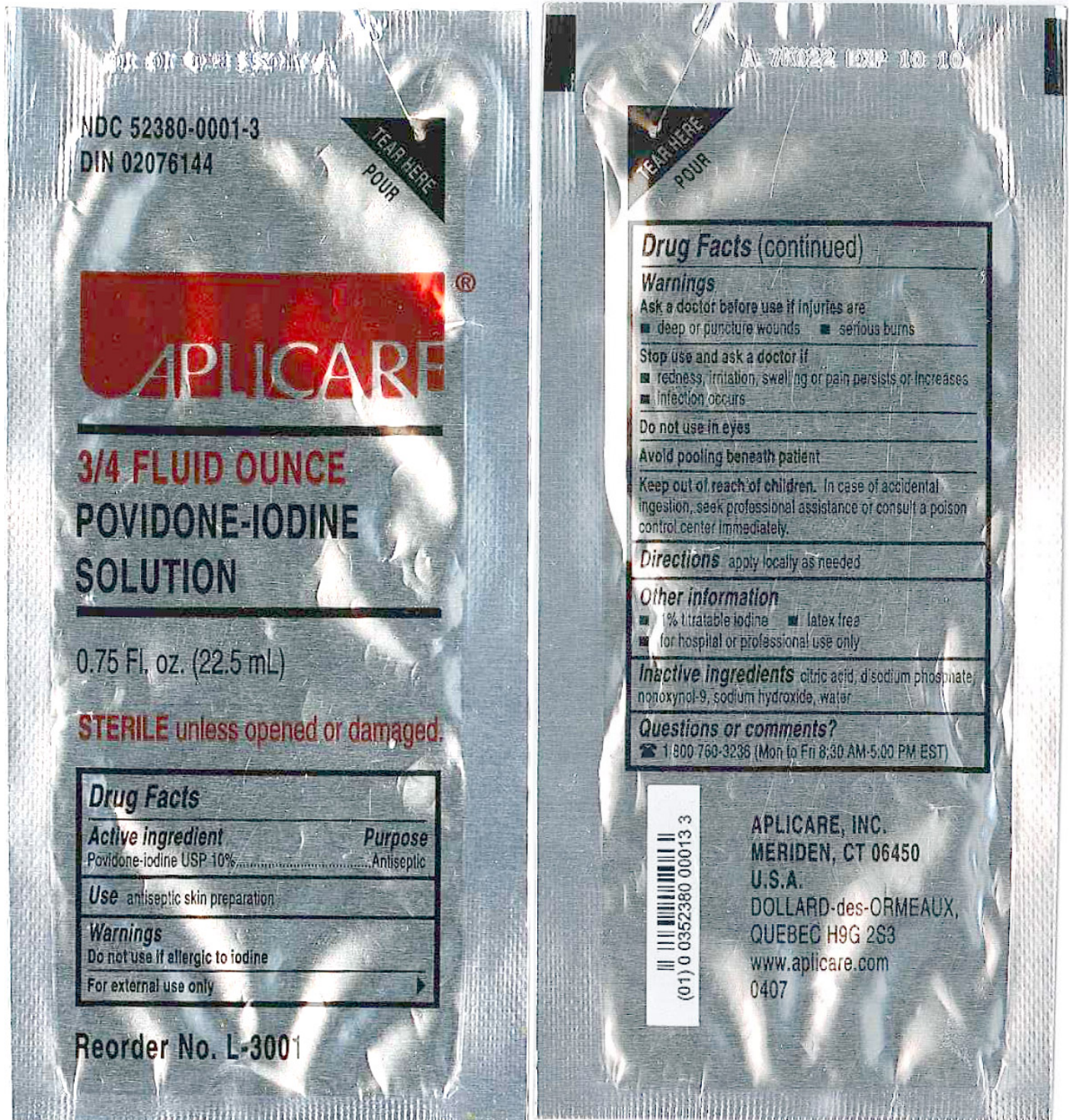
Package Label Display Panel

Keep out of reach of children. In case of accidental ingestion, seek professional assistance or consult a poison control center immediately.