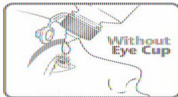
Without Eye Cup

Remove contact lenses before using. ■ Do not touch tip of container to any surface to avoid contamination. ■ Replace cap after use.