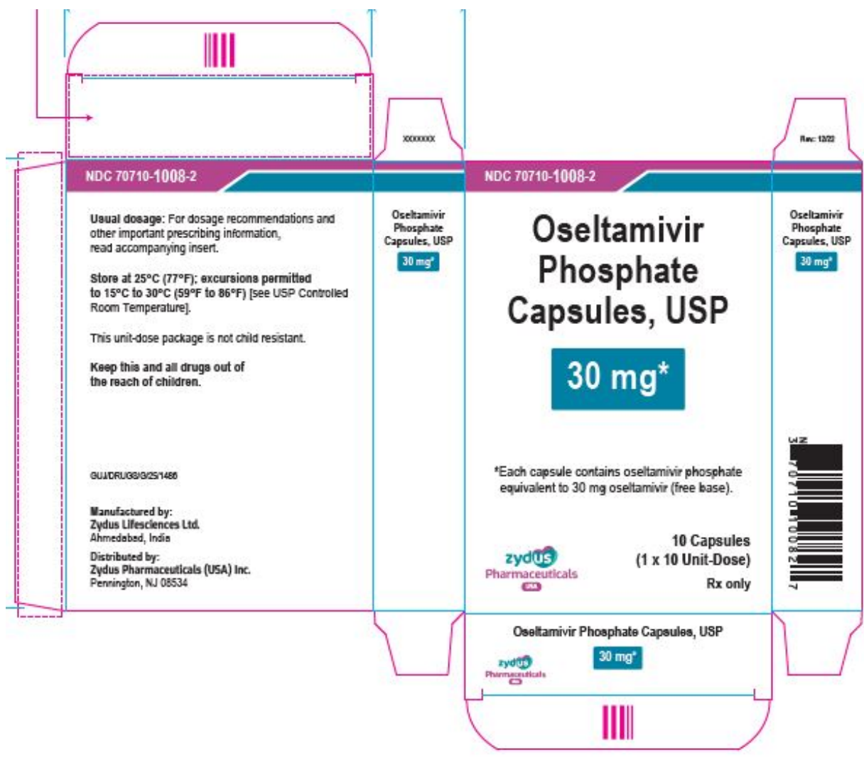
30 mg Carton