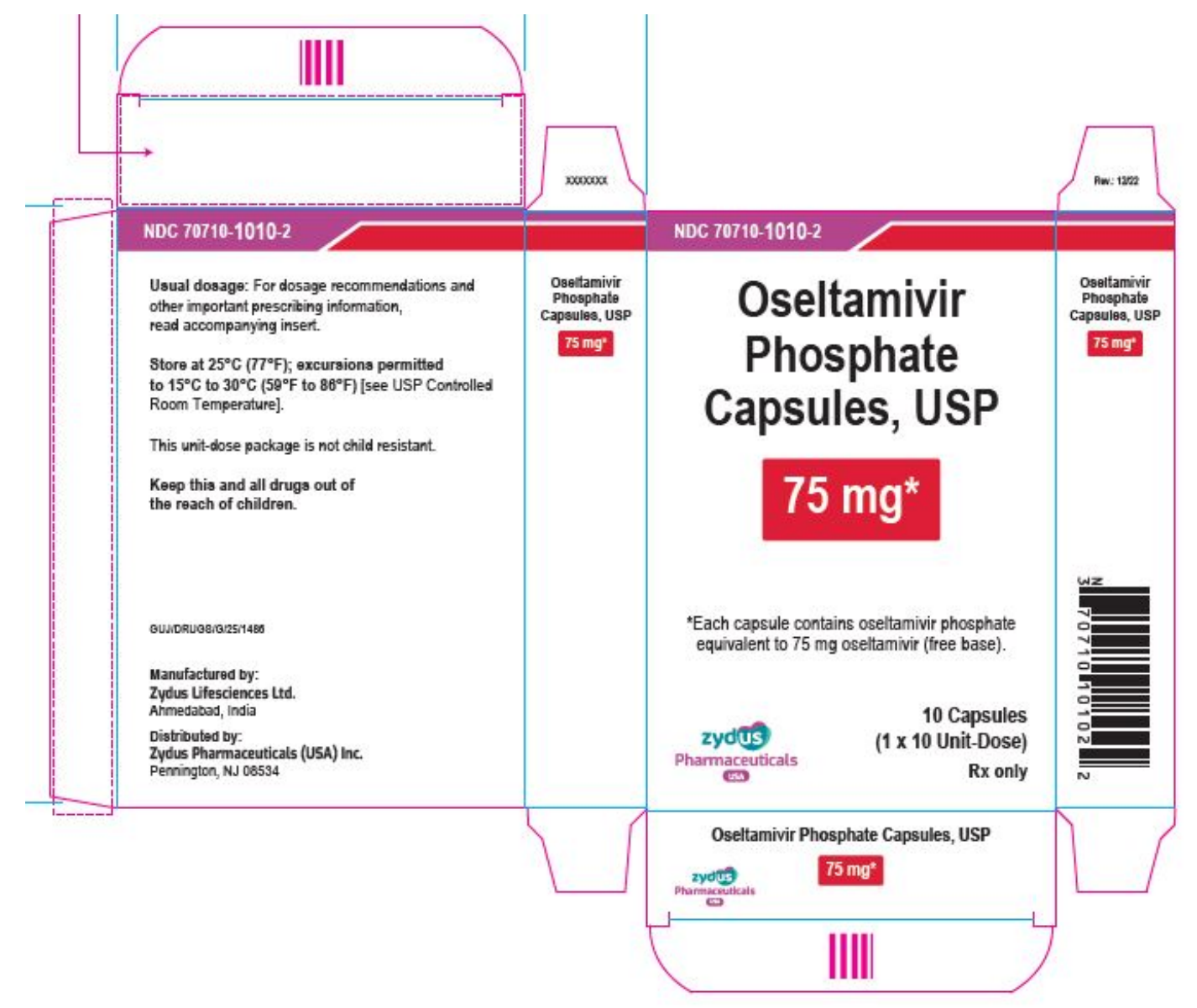
75 mg Carton