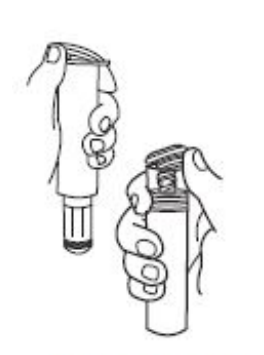
1. Remove protective caps.