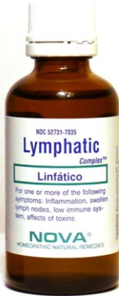
Lymphatic Complex Bottle Label