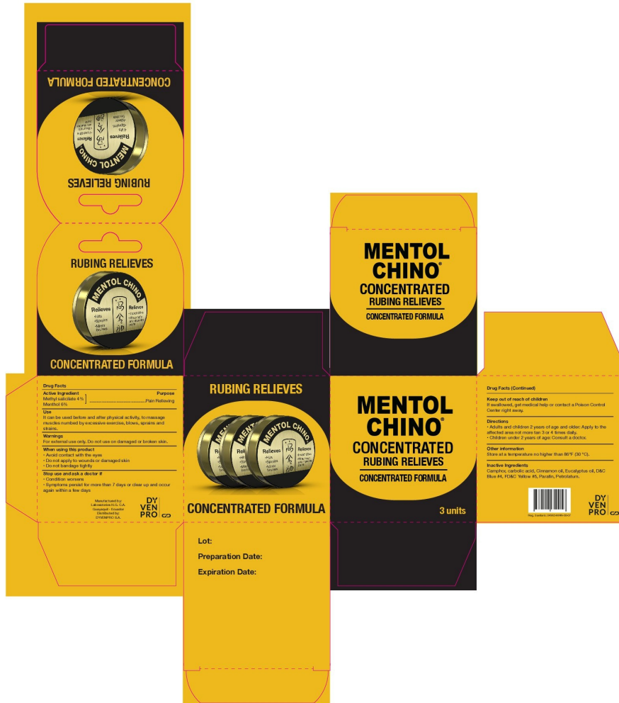
MENTOL CHINO FORTE. Package Label.Principal Display Panel (51945-4)