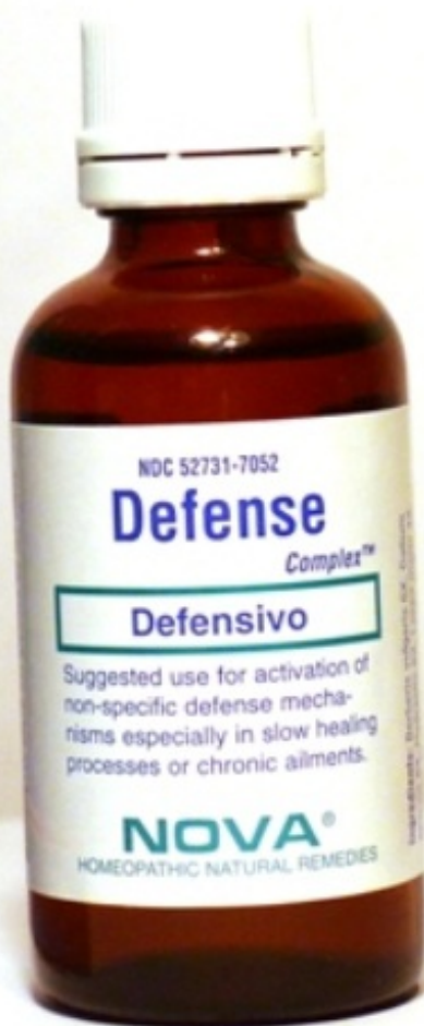
Defense Complex Bottle Label