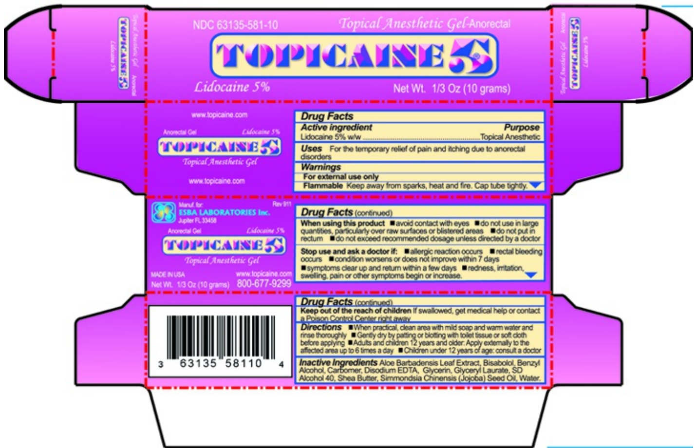
Label affixed to tube of Topicaïne 5 % 30 g tube