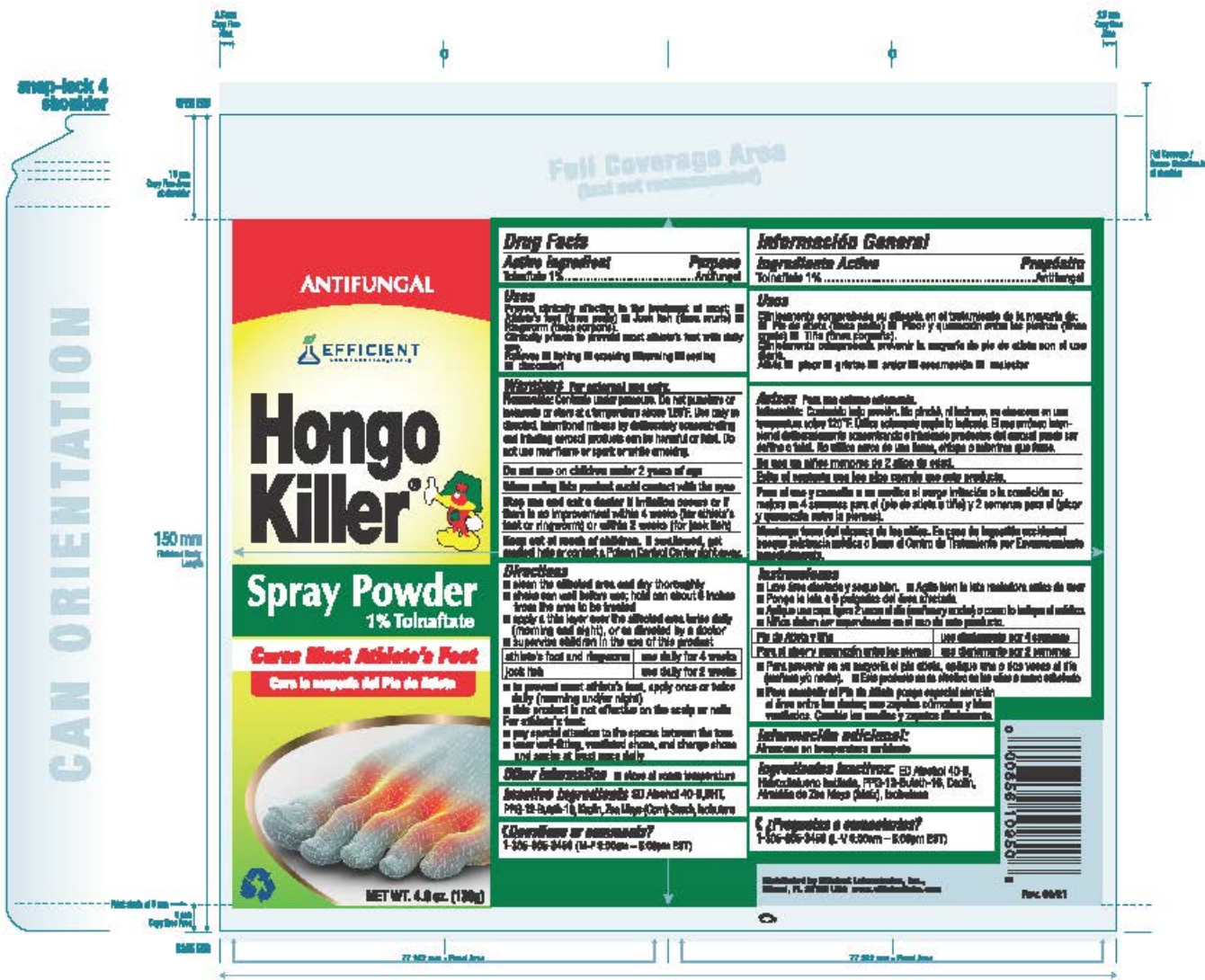
194,504 mm (53 mm dissolar crea)