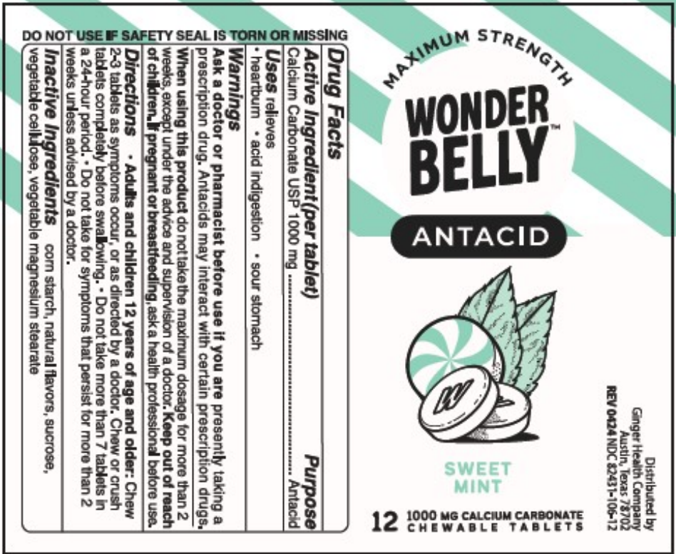
Principal Display panel-12ct Bottle Rev 0224