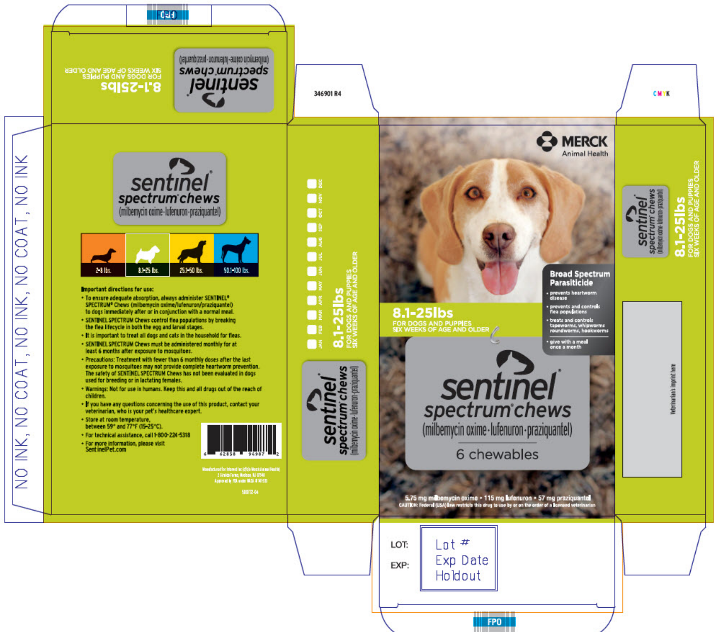
PRINCIPAL DISPLAY PANEL - 6 Chewable Blister Pack Carton - 5356-02

CAUTION: Federal (USA) law restricts this drug to use by or on the order of a licensed veterinarian