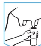
Teat Dip Baño de tetina