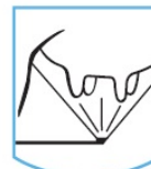
Teat Spray Roceador de tetina