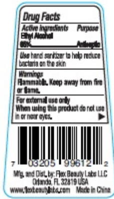
TOP SIDE SHOWN Color: Black