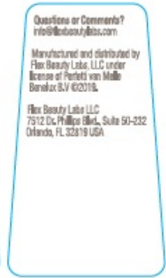
INSIDE RIGHT Color: Warm Gray 9