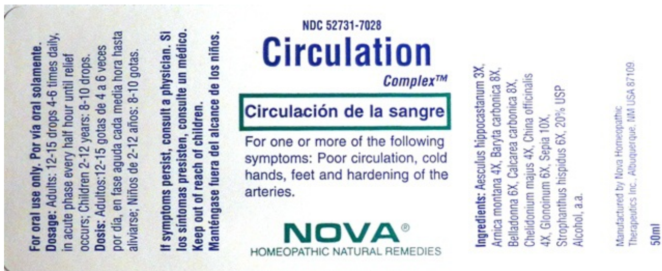
Circulation Complex Box