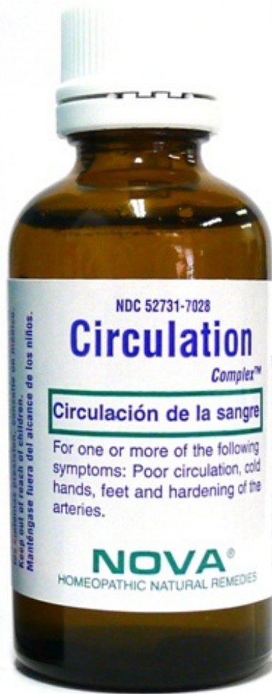
Circulation Complex Bottle Label