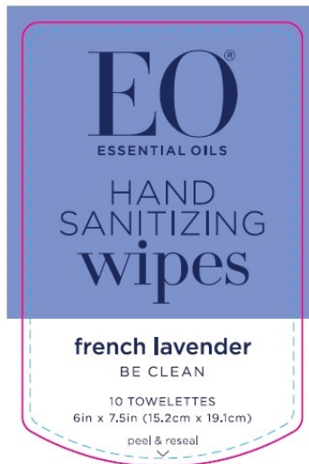
INNER PACKAGE LABEL