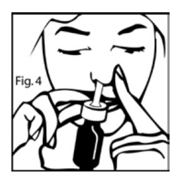
Step 4. Breathe out through your mouth.

Step 5. If a second spray is required in that nostril, repeat steps 2 through 4.