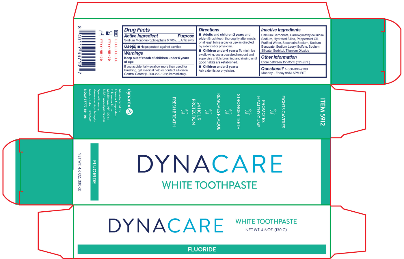
5912 White Toothpaste