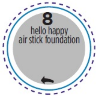
PAGE 1 (FRONT)