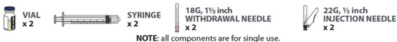
Figure 2 YEZTUGO Injection Steps for Withdrawal Needle Injection Kit