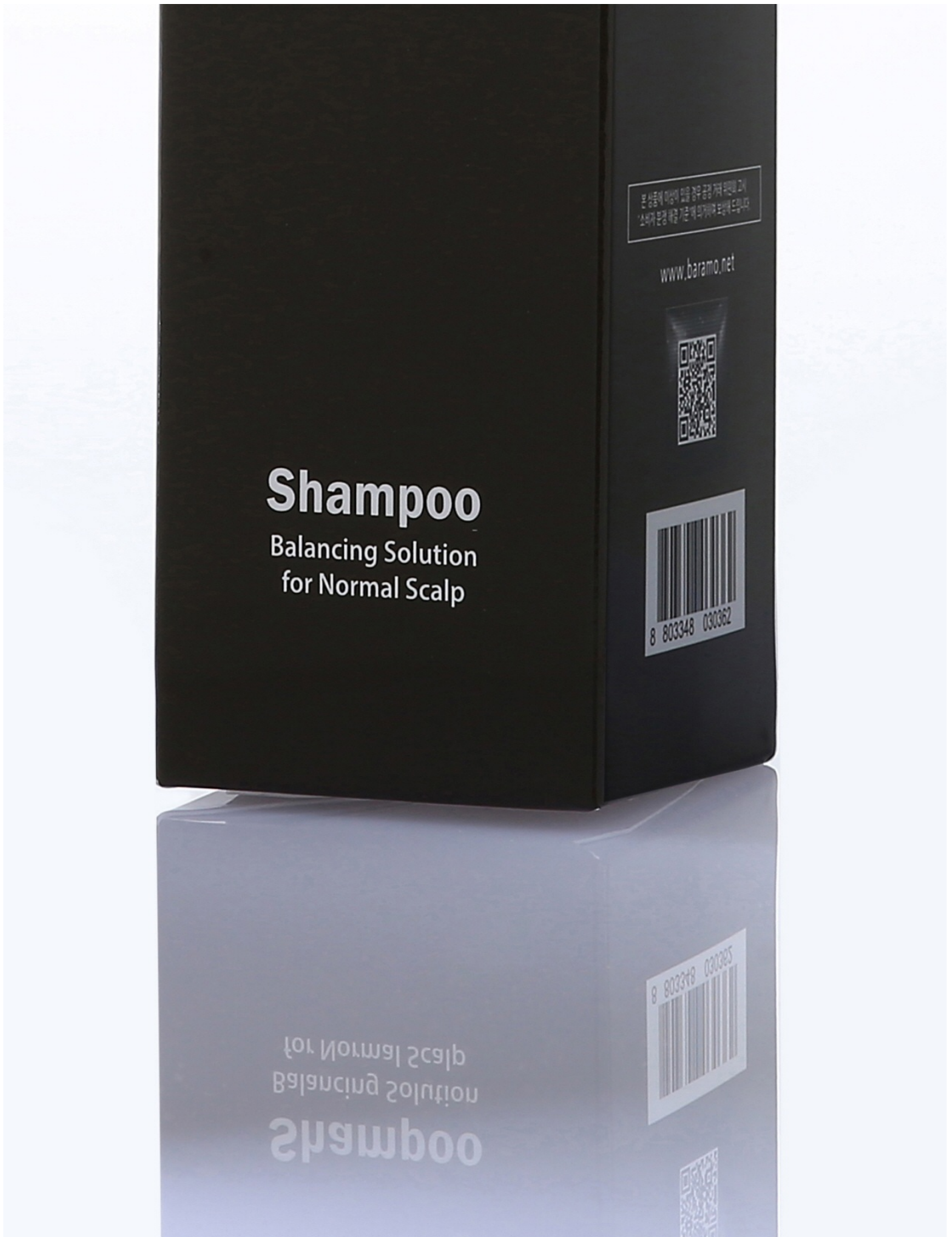
BARAMO FOR NORMAL SCALP