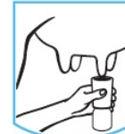
Teat Dip Baño de tetina

Read other label for directions for use, first aid and precautionary statements Lea la otra etiqueta para direcciones de uso, primeros auxilios y medidas preventivas