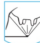
Teat Spray Rocedor de tetina