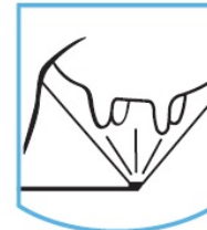
Teat Spray Roceador de tetina

Read other label for directions for use, first aid and precautionary statements Lea la otra etiqueta para direcciones de uso, primeros auxilios y medidas preventivas