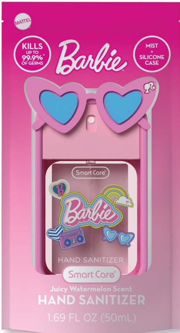
Inner Package Label