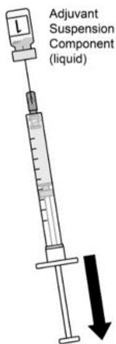
Figure 1. Cleanse both vial stoppers. Using a sterile needle and sterile syringe, withdraw the entire contents of the vial containing the adjuvant suspension component (liquid) by slightly tilting the vial. Vial 1 of 2.

AREXVY is supplied in 2 vials that must be combined prior to administration. Prepare AREXVY by reconstituting the lyophilized antigen component (a sterile white powder) with the accompanying adjuvant suspension component (an opalescent, colorless to pale brownish sterile liquid). Use only the supplied adjuvant suspension component for reconstitution. The reconstituted vaccine should be an opalescent, colorless to pale brownish liquid. Parenteral drug products should be inspected visually for particulate matter and discoloration prior to administration, whenever solution and container permit. If either of these conditions exists, the vaccine should not be administered.