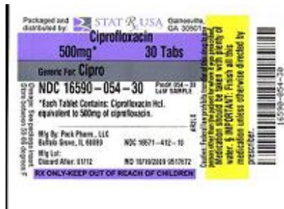
CIPROFLOXACIN 500MG LABEL IMAGE

PACK Pharmaceuticals, LLC, Buffalo Grove, IL 60089 USA