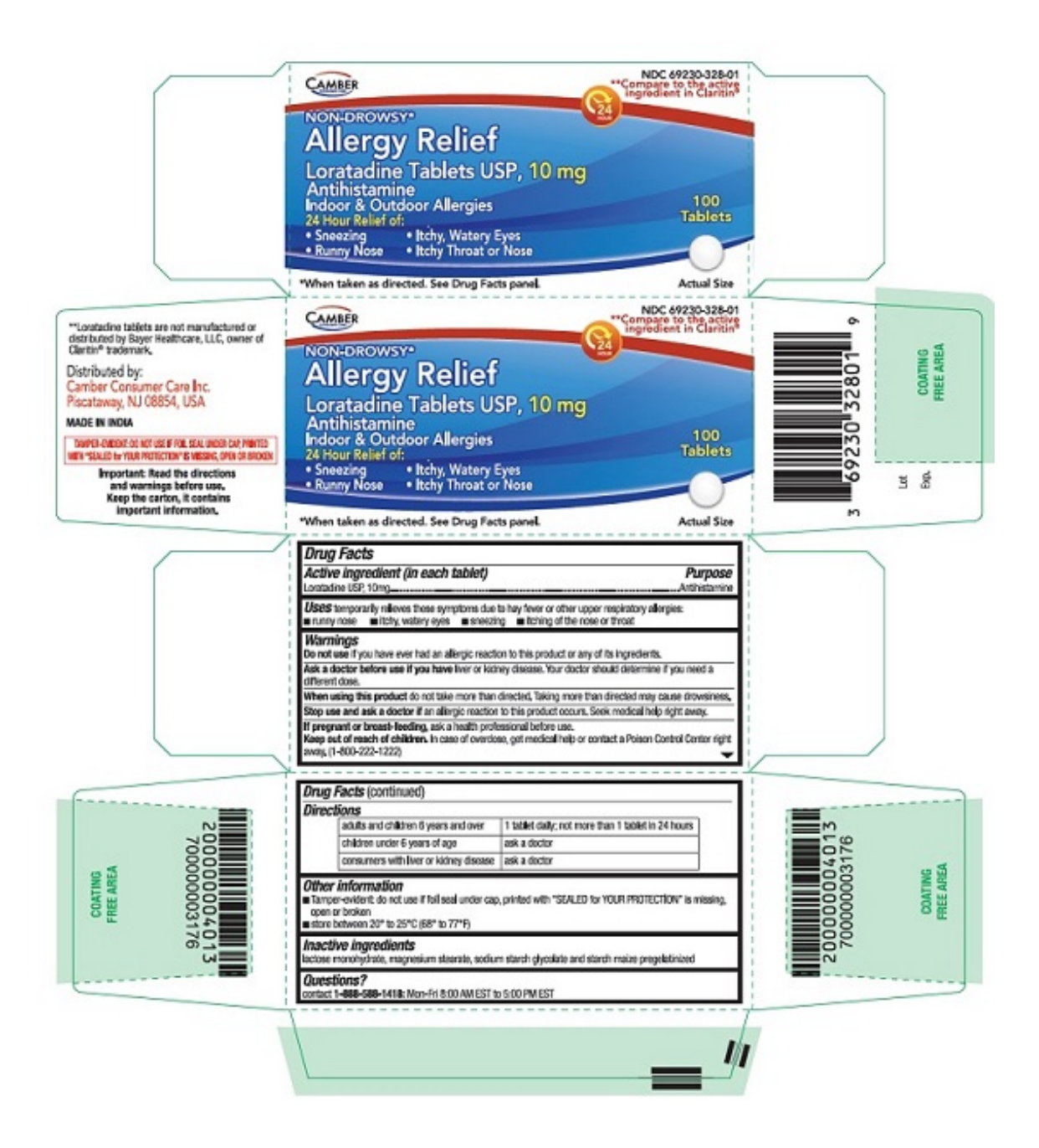
Loratadine 10 mg 100-count Container Label