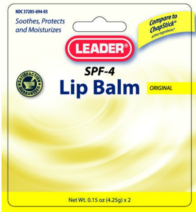
Back of Card