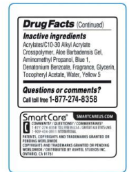
Page 2 (Last Page)