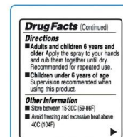
Page 1 (Inside Cover)