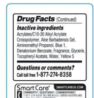
Page 2 (Last Page)