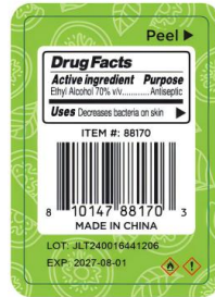
Back Sticker (cover)