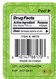
Back Sticker (cover)