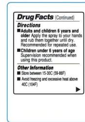
Page 1 (Inside Cover)