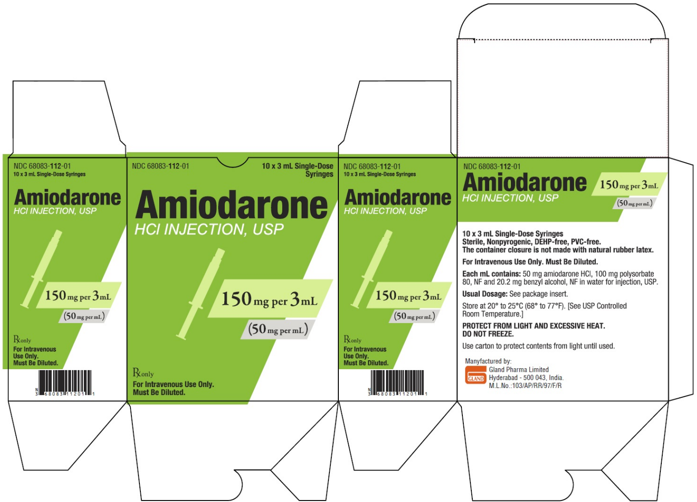
Amiodarone Inner Carton Label