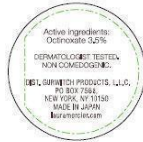
bottom label - 1 3/8" diameter BOTTOM