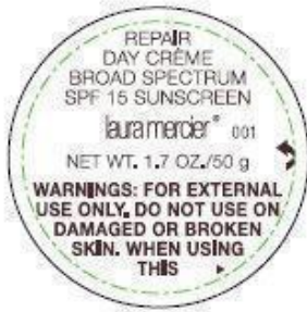
bottom label - 1 3/8" diameter TOP