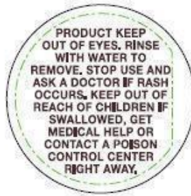
bottom label - 1 3/8" diameter TOP BACK