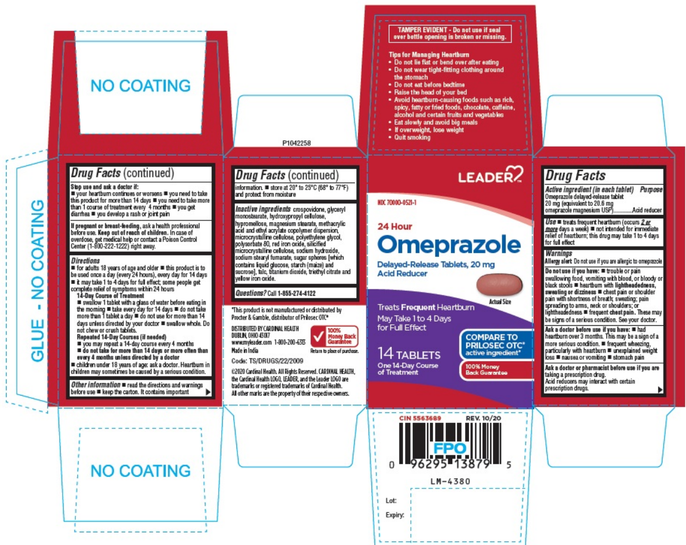
PACKAGE LABEL-PRINCIPAL DISPLAY PANEL - 20 mg Blister Carton Label

COMPARE TO PRILOSEC OTC® active ingredients* 100% Money Back Guarantee 14 TABLETS One 14-Day Course of Treatment