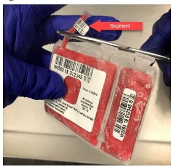
Figure 3a Figure 3b