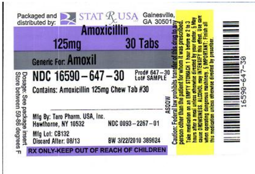
AMOXICILLIN 125MG LABEL IMAGE