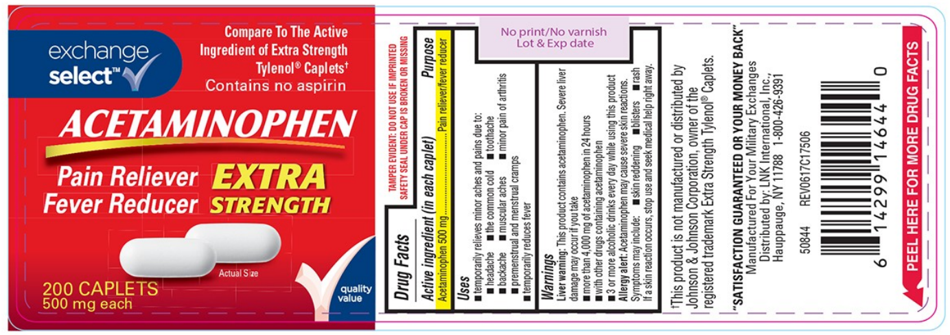
Exchange Select 44-175